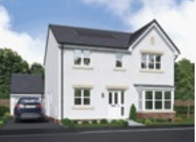
4 Bed 1,349 sq ft

A bay window and double doors give the lounge a classic elegance that complements the bright, relaxed family kitchen and dining room with its feature french doors. There is a separate laundry room and a study, and the four bedrooms include a luxurious L-shaped en-suite principal bedroom.