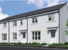
3 Bed 900 sq ft

The lounge opens, through a separate lobby, into a beautifully designed kitchen and dining room where french doors keep the room light and airy, and make outdoor meals a tempting option. One of the three bedrooms features an en-suite shower and there is a useful storage cupboard on the landing.