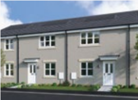
2 Bed 650 sq ft

The contemporary, open design of the living room, with its integrated staircase, maximises the sense of space, and the built-in storage includes a useful cupboard as well as a built-in wardrobe in the principal bedroom. The second bedroom, ideal for guests, could also become a useful home office.