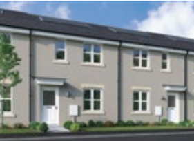
3 Bed 750 sq ft

Designed for maximum practicality and convenience, the kitchen shares the ground floor with a living and dining room where french doors opening to the garden fill the interior with fresh, natural light. In addition the principal bedroom has a useful store, and there is a cupboard in the hall and under the stairs.