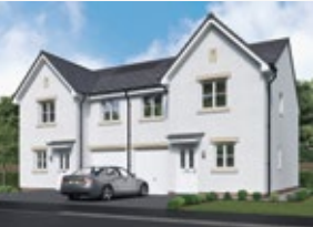
4 Bed 1,119 sq ft

French doors add a focal point to the living and dining room, while the adjoining kitchen keeps cooking and household management separate from the social space without any loss of convenience. The principal bedroom includes an en-suite shower.