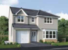
4 Bed 1,446 sq ft

The elegantly proportioned exterior reflects the immense prestige of this exceptional family home. From the lounge's bay window to the feature staircase with half landing, from the french doors of the dining room to the en-suite showers in the principal bedroom, comfort is combined with visual appeal.