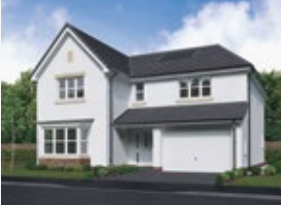
5 Bed 1,693 sq ft

The traditional bay window gives the lounge an elegant appeal, complementing a superb L-shaped dining and family room that opens on to the garden, and extends into an ergonomically designed kitchen with a separate laundry room. Two of the five bedrooms are en-suite, and one features a dedicated dressing room.