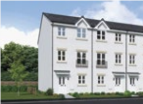
3 Bed 1,202 sq ft

The stylishly ergonomic walk-through kitchen and the bright dining room, opening out to the garden, makes innovative use of space to create an inspiring setting for family evenings, as well as an ideal backdrop to relaxed entertaining. The lounge shares the first floor with an en-suite principal bedroom.