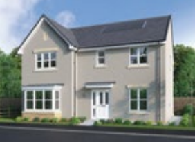
5 Bed 1,601 sq ft

From the lounge's traditional bay window to the striking natural lighting of the magnificent, open, dual aspect family kitchen and dining room, from the separate study to the five bedrooms, two of them en-suite, this is an impressively spacious and prestigious family home.