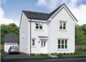
4 Bed 1,219 sq ft

The open, flexible layout of the kitchen and dining room, with its french doors and convenient self-contained laundry space, offers both a relaxed family area and a convivial backdrop to entertaining. There is an en-suite principal bedroom and the fourth bedroom could become a useful home office.