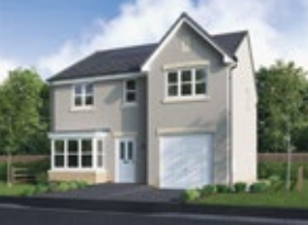
4 Bed 1,297 sq ft

With twin windows and central french doors, the kitchen and dining room maximises the benefits of the garden to present an adaptable, comfortable setting for family life. The lounge features a stylish bay window, and the delightful principal bedroom includes an en-suite shower and a sumptuous dressing area.