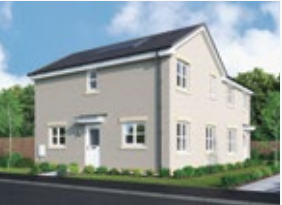
3 Bed 897 sq ft

The impact of natural, welcoming light created by the triple windowed, dual aspect lounge is further enhanced by the dual aspect kitchen with its french doors adding a focal point to the dining area. The principal bedroom, incorporating en-suite facilities presents a private retreat with a dash of luxury.