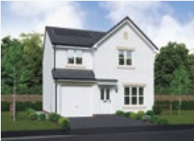
4 Bed 1,036 sq ft

With a separate laundry to prevent household management from encroaching on the social space, and french doors adding a bright focal point, the kitchen provides a natural hub for everyday family life. With four bedrooms, one of them en-suite, there is always an opportunity to find peaceful seclusion.