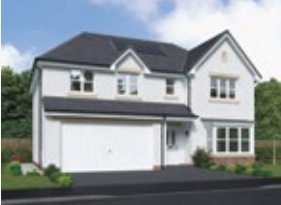
5 Bed 1,510 sq ft

Double doors open to combine the lounge, dining room and kitchen into a single space from bay window to french doors, an unforgettable setting for relaxed social gatherings. With five bedrooms, two of which have en-suite showers, this is a home capable of accommodating the largest family in comfort.