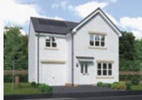
4 Bed 900 sq ft Scan to view floorplans

The kitchen and dining room includes french doors, while the lounge's integrated staircase and the generous storage space, including a cupboard in bedroom two and a built-in wardrobe in the en-suite principal bedroom, demonstrate the practical details found throughout this family home.