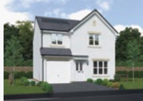
4 Bed 1,036 sq ft Scan to view floorplans

With a separate laundry to prevent household management from encroaching on the social space, and french doors adding a bright focal point, the kitchen provides a natural hub for family life. With four bedrooms, one en-suite with a built-in wardrobe, there is always an opportunity to find peaceful seclusion.