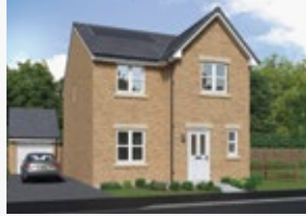
4 Bed 1,088 sq ft Scan to view floorplans

The inviting lounge is complemented by a bright kitchen, where french doors opening to the garden add an airy, open ambience and a separate laundry area leaves the social space free for dining. The four bedrooms include a superb en-suite principal bedroom with a built-in wardrobe.