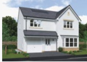
4 Bed 1,424 sq ft Scan to view floorplans

Behind the attractive bay window and canopied entrance, this exciting home features a lounge that opens through to a family dining space extending into an expertly planned kitchen, while french doors keep the space light and fresh. A shared shower room provides three of the four bedrooms with en-suite facilities.