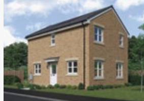
3 Bed 897 sq ft Scan to view floorplans

The lounge, beautifully lit by windows at either end, shares the ground floor with a dual aspect kitchen featuring french doors in the dining area, further enhancing the light, open appeal. A separate laundry room aids household management, and the en-suite principal bedroom incorporates a built-in wardrobe.