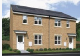
3 Bed 750 sq ft Scan to view floorplans

Designed for maximum practicality and convenience, the kitchen shares the ground floor with a living and dining room where french doors opening to the garden fill the interior with fresh, natural light. In addition to the built-in wardrobe in the principal bedroom, there is a useful cupboard in the hall.