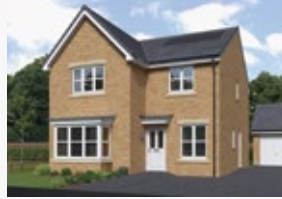
4 Bed 1,388 sq ft Scan to view floorplans

From the bay window in the lounge to the superb family kitchen with garden access, from the gallery landing and the twin wardrobes of the en-suite principal bedroom, this is a home filled with premium features. The study provides a peaceful retreat for working from home or creating a computer room.