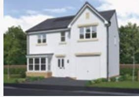
4 Bed 1,297 sq ft Scan to view floorplans

With twin windows and central french doors, the kitchen and dining room maximises the benefits of the garden to present an adaptable setting for family life. The lounge features a stylish bay window, and the principal bedroom includes an en-suite shower and a sumptuous dressing area with twin wardrobes.